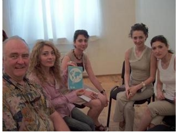
Capturing a workshop moment

Using the Growth Model of Virginia Satir, further elaboration increased the participants' sensitivity to how relationships within a family and within a society are constructed. The hope is to develop relationships in which each person is seen and treated as having equal value.