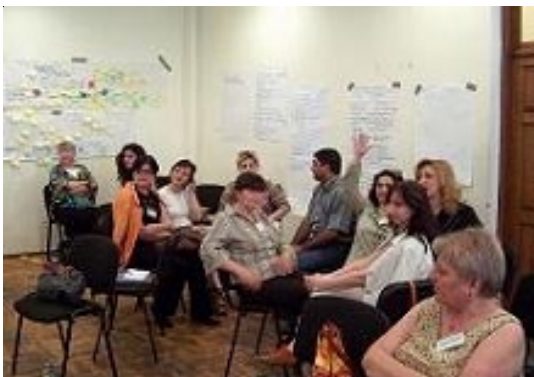
Identifying historical milestones