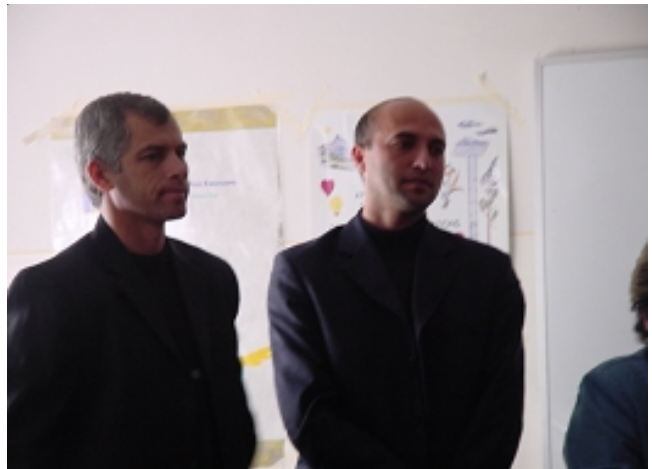
Two Tajik participants in a sculpt about communication with ourselves